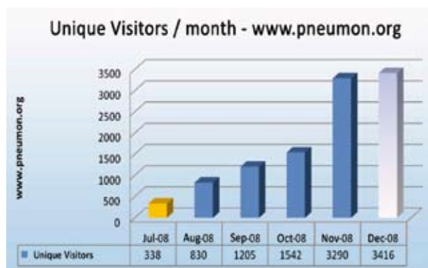
FIGURE 1. Number of visitors to the PNEUMON website per month, as of mid of December 2008.

I take this opportunity to wish to all readers a Happy New Year, with the good news of the indexing the Journal in scientific databases.