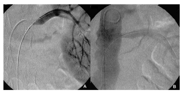
Figure 2. Digital subtraction angiography demonstrating solitary left renal artery thrombosis (A) and recanalization after angioplasty and stenting (B).