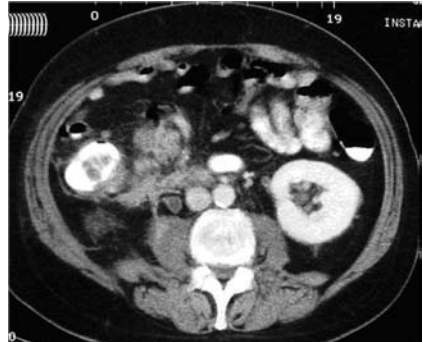
Figure 2. CT of the abdomen after intravenous contrast medium. Mass at the terminal ileum invading the surrounding mesenteric fat.