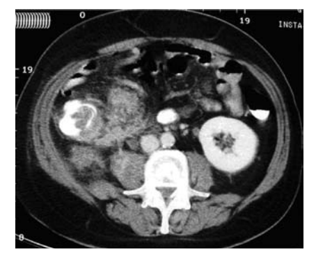
Figure 3. CT of the abdomen after intravenous contrast medium (lower level). Mass at the terminal ileum invading the surrounding mesenteric fat. Haziness of the paranephric fat.