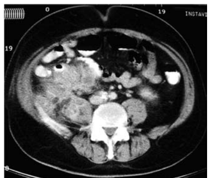
Figure 4. CT of the abdomen after intravenous Figure 5. CT of the abdomen after intravenous contrast medium. Mass which uptakes contrast medium, infiltrating the right iliopsoas muscle.