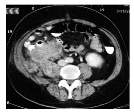
contrast medium. Mass which uptakes contrast medium, infiltrating the right iliopsoas muscle.