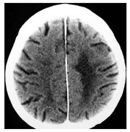
Figure 2. A second brain CT scan shows minimal changes compared with the first CT scan. No significant peripheral enhancement is seen.