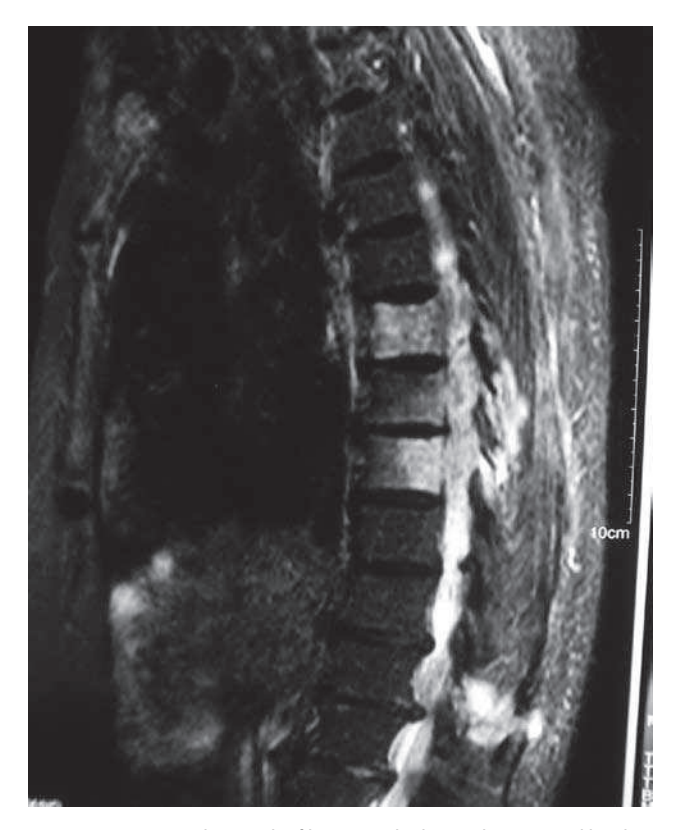
Figure 4. MRI scan detected infiltrates in the lower thoracic and lumbar spine.

Main symptoms include prolonged intermittent bone pain, present for months if not years, local swelling and palpable mass (the area of the involved tumor may be tender or swelled), and systemic symptoms