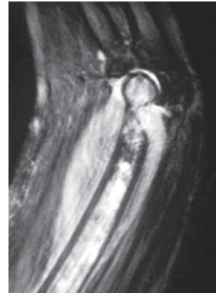
Figure 3. MRI demonstrating a periosteal soft tissue mass/edema in the distal humerus extending to the left elbow joint with a small fluid collection intraarticularly.