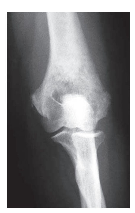
Figure 1. X-ray reveals a mottled appearance of the distal third of the left humerus.

revealed pathologic appearance of both her 9th ribs posteriorly, with mixed lytic and sclerotic changes. Additionally there was a pathologic soft tissue mass in her right side protruding partly into her right hemithorax and posteriorly in her right back. All the above suggested the presence of secondary focuses. No space occupying lesion was detected in her lung parenchyma and mediastinum. Mediastinal lymph nodes were not detected. Abdominal lymph nodes were not revealed at the abdominal CT scan. Thoracolumbar spine MRI scan detected infiltrates in her lower thoracic and lumbar spine. Those infiltrates were accompanied by paraspinal dense tissue mass that extended into the corresponding subdural space at the level of 7th to 9th thoracic vertebrae and between 12th thoracic and 1st lumbar vertebra. Compression of the spinal column was detected at the level of 8th to 9th thoracic vertebrae (fig. 4). Definite diagnosis