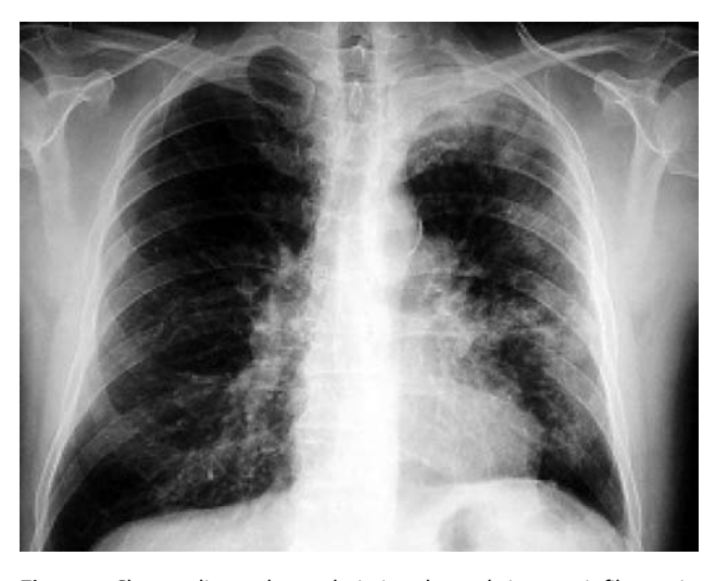
Figure 1. Chest radiograph on admission showed air space infiltrates in the left upper pulmonary zone with peripheral distribution.

Department of Computed Tomography and Interventional Radiology, "Sotiria" General Hospital of Chest Diseases, Athens, Greece