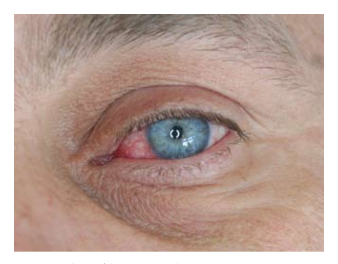
Figure 2. Redness of the conjunctival mucosa.