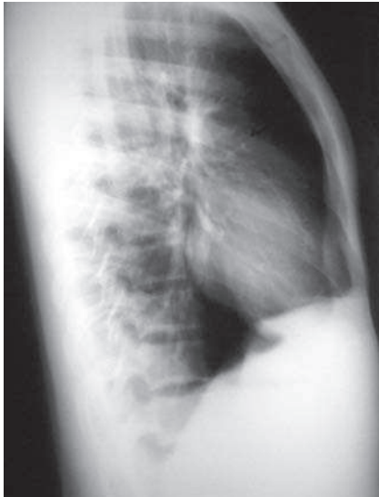
Figure 2. A dense opacity of the left lower lobe.