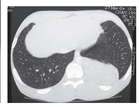
Figure 3. Consolidation in the posterior basal segment.