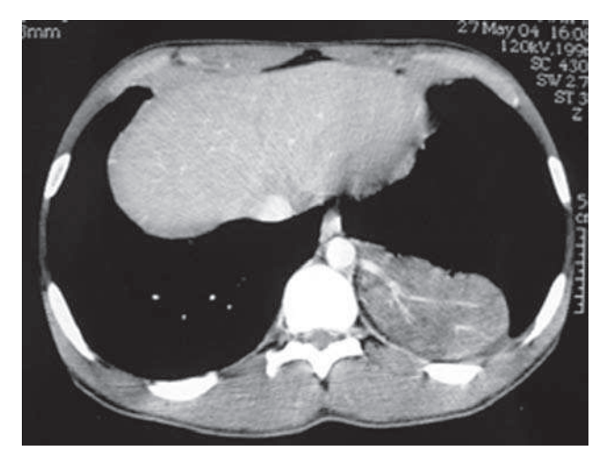
Figure 4. Arterial supply from the aorta.

early infant, often this is because other congenital anomalies are present, including congenital diaphragmatic hernia, and cardiac malformations. ELS may occur above, within, or below the diaphragm, and nearly all appear on the left side.