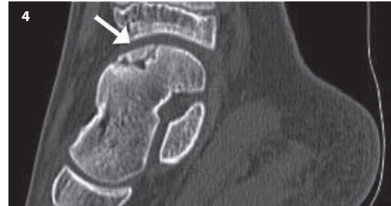
Figures 3 and 4. Axial and sagittal CT images show a bony fragment at the dome of right talus. The lesion has sclerotic margins, is detached from the parent bone, without deformation of the articular surface.