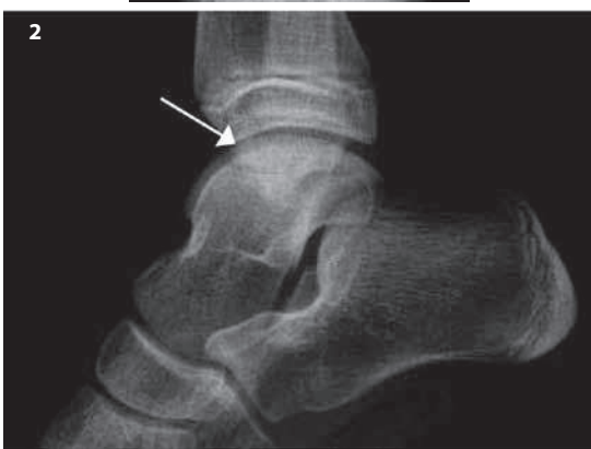
Figures 1 and 2. Anteroposterior and profile radiographs of the right ankle demonstrate a lucent subchondral lesion with sclerotic margins at the talar dome (arrows).