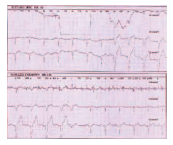
Figure 3. 24 hours Holter rhythm monitoring

conduction system demonstrated a block. When these abnormal T waves appear pronounced –the so-called Wellens' waves– they could represent a critical left anterior descending branch lesion.