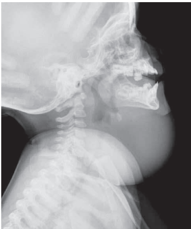
Figure 1. Neck X-ray (lateral view): Soft tissue mass in anterior neck region. Normal imaging of upper respiratory tract.

A 2½-year-old girl presented to the Emergency Department of our hospital due to sudden enlargement of a known painless swelling in the right upper neck region. Clinical examination revealed a large right neck mass, with local warmth and tenderness. Neck X-ray showed a soft tissue mass with normal appearance of upper respiratory tract (fig. 1). Ultrasound showed a large lesion, of mixed echotexture, with deep cystic component, echogenic areas with intracystic septae (hemorrhagic), that dislocated gently the right carotid artery and the right internal jugular vein (figures 2a, 2b). Imaging findings were consistent with clinical main diagnosis. Magnetic resonance imaging (MRI) of neck was performed in an outpatient diagnostic center, in order to examine the lesion's relations with adjacent deep structures and plan its treatment. Surgical resection was performed and histopathology verified the radiologic main diagnosis.