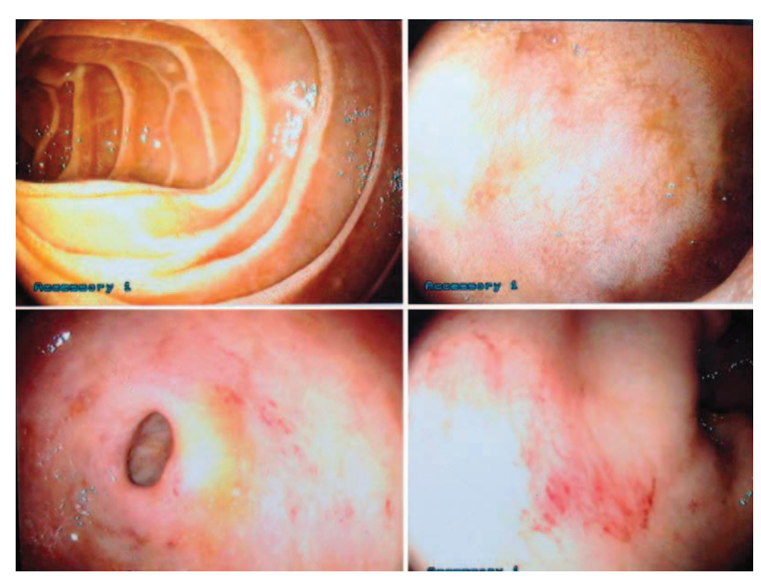
Figure 3. Endoscopic findings in a 79-year-old male with gastrointestinal bleeding, showing duodenitis, erosive volvitis, and erosive gastritis, with signs of recent hemorrhage.

mean length of hospital stay was 5 days. All three patients presented with a slightly raised serum level of Cr, which suggests that older patients should always be monitored for renal function when taking NOACs.