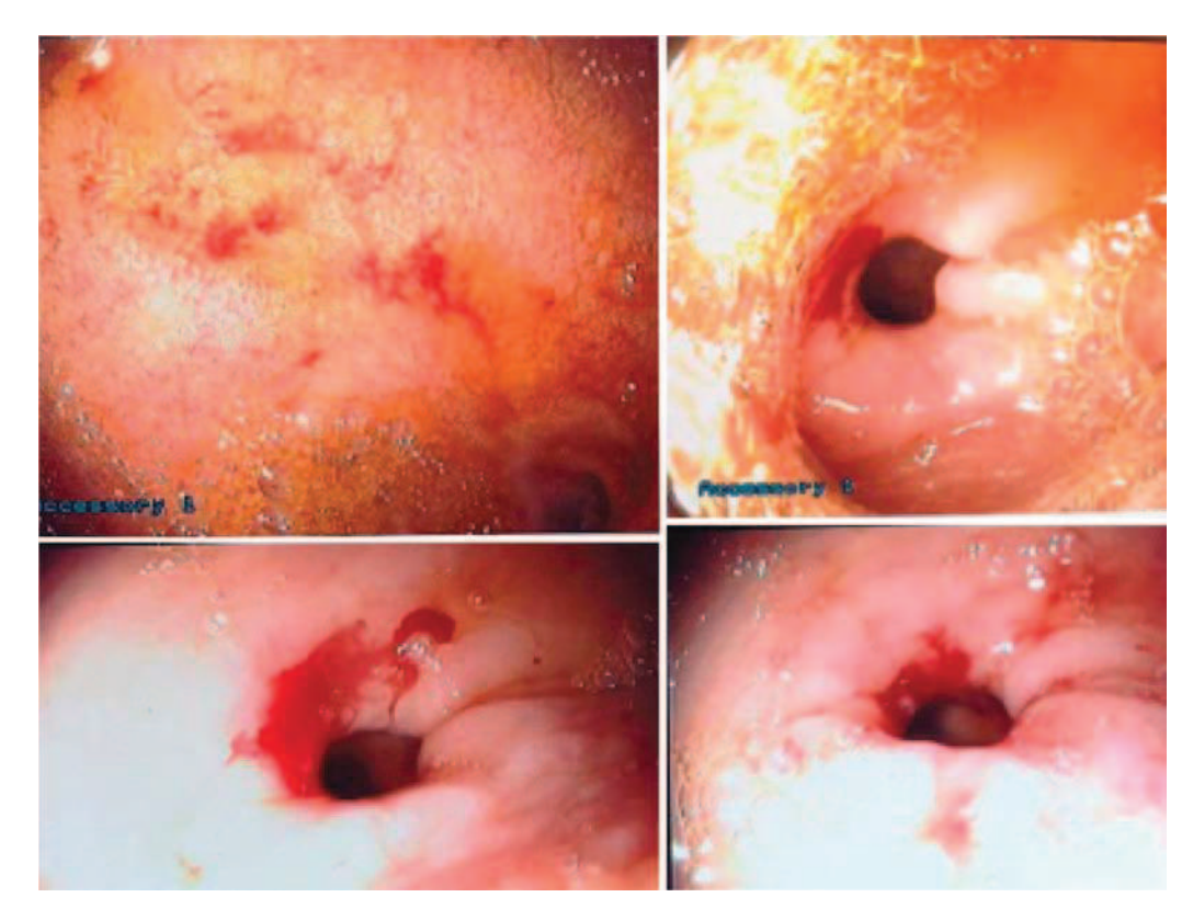
Figure 2. Endoscopic findings in a 72-year-old woman with gastrointestinal bleeding, showing hemorrhagic erosive gastritis of the body and antrum of stomach, with mild propyloric oozing (Forrest 1b).

The present series comprises three patients with no previous known history of GI tract pathology, who presented with signs of upper GI bleeding (hematemesis and or melena) while being treated with a NOAC. Endoscopic findings included erosive gastritis (cases 2, 3), volvitis and duodenitis. In the first two cases, endoscopic hemostasis was required in order to prevent further hemorrhage, while in the third patient the hemorrhage was self-restricting. The