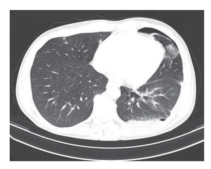
Figure 2. Computed tomography (CT) of the chest demonstrating pneumothorax and pleural effusion of the left lung, major complications of septic lung emboli.

in varying stages of cavitation, accompanying small pleural effusions. CT play an important role in the diagnosis of pulmonary septic embolism revealing subpleural nodular lesions or wedge-shaped densities with or without cavitation. In 80% of cases CT features include bilateral abnormalities. Major complications include empyema, pneumothorax and pleural effusion.