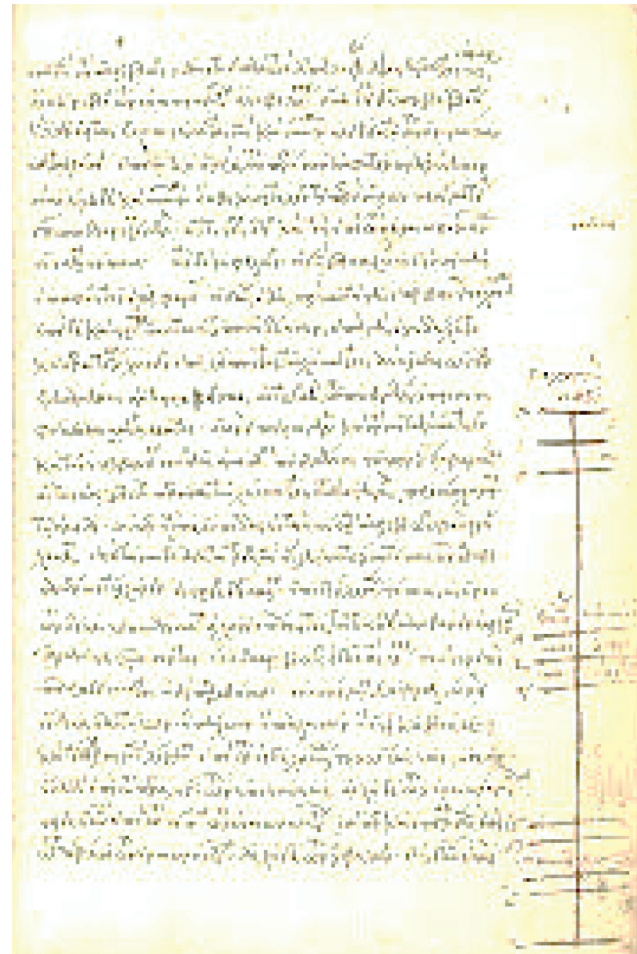
Figure 3. MS copy of Ioannes Actuarius' De Urinis. On the right hand margin a drawing of his vial with the various zones of the non-soluble mater (scribal addition?) MS.MSL.52 (f. 54r). Wellcome Library), London.

in the amis (the examining bottle, which he was the first to insist that it should be made from an excellent quality of glass). When the disease subsides (and hence, proteinuria decreases) the sediment precipitates. However, Joannes goes a step further. He introduced a uroscopy vial with eleven horizontal lines numbered from the bottom upwards. When the cellular components occupy the second to fourth line, they are called Hypostasis, when the sixth to the eighth enaeorema, while the nepheloma lays in the 10th to 11th line. Using this vial, a more accurate description of the cells' location was possible. There are also intermittent zones (figures 2, 3). In his treatise on urines, he also expressed the overall parallelism in Byzantine thinking between the microcosm and macrocosm. Acturius e.g. writes: "Because it has also been said that during obstructions the excreted urines may appear to be thin, it is worth mentioning the presumed causes. [...] Because whenever some people had a muddy and thick wine, they had passed it repeatedly through a straining cloth, and satisfactorily thinned it, having taken away the thickness through the passage, [...] similarly, it must be considered that the same may happen if during obstructions in any quarter the urine is seen thin, [hence] someone would rather blame the material obstructing the passages than a metabolic disorder". 26 The notion that a renal obstruction may cause thinner urine has been recently verified when