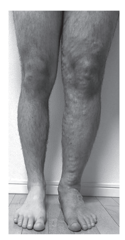
Figure 1. Edematous left lower extremity.

Differential diagnosis of chronic edema of the lower extremities includes lymphedema, myxedema, renal insufficiency, heart insuf-