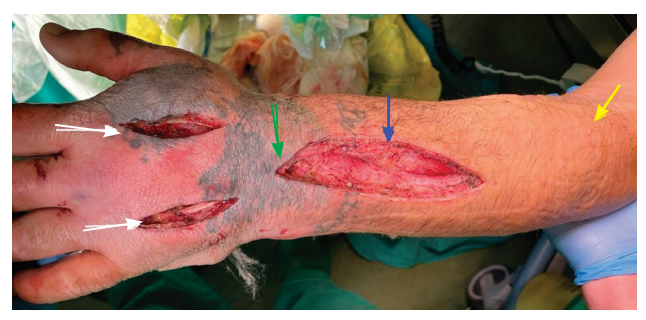
Figure 2. Dorsal forearm and hand fasciotomy included one longitudinal dorsal incision starting at the level of the lateral humerus epicondyle (yellow arrow) towards the midline of the wrist (green arrow) and two longitudinal dorsal incisions over 2nd and 4th metacarpals (dorsal compartment: blue arrow, dorsal/volar interossei and adductor compartment: white arrow).

Third intention wound healing initiated with repeat irrigation over the following 5 days and subsequent early primary closure of dorsal and lateral wounds on postoperative day 6 and delayed closure with split thickness skin graft of the volar wound on postoperative day