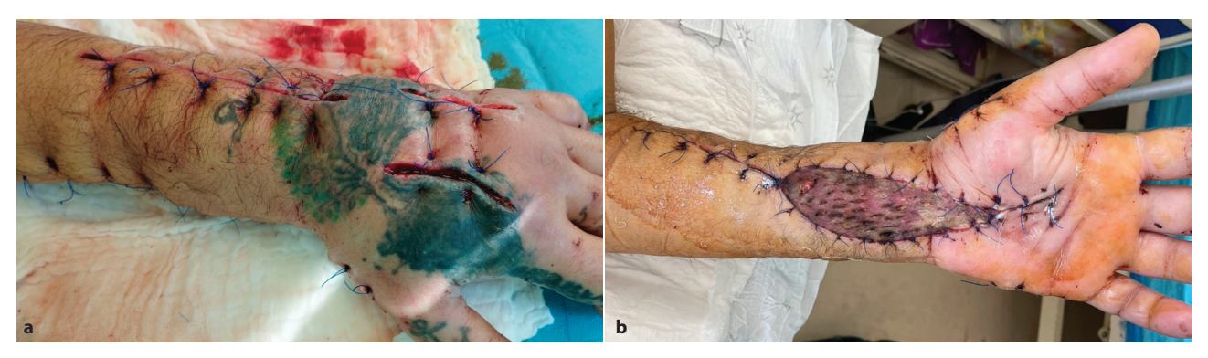
Figure 4. Early (a) primary dorsal and lateral wounds closure on postoperative day 6 and (b) delayed split thickness skin graft volar wound closure on postoperative day 12.

12 (fig. 4 a, b). Interestingly, blood, urine and intraoperative wound cultures were negative. Postoperative course was uneventful and the patient discharged home on postoperative day 14.